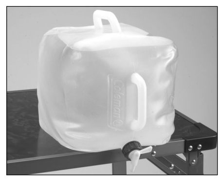
5 gallon Water Container Collapses for compact storage when not filled with water – handled carrier includes spigot to dispense water. Threaded opening is sized to screw securely to pump of Hot Water on Demand<sup>™</sup> for a sealed connection. (#809B605T)

Water Hose Adapter Regulates water pressure from input hose up to 100 PSI. Simply attach to Hot Water on Demand<sup>™</sup> for a continuous water supply. Not Included (#2300-511)